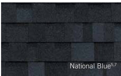
National Blue 5,7