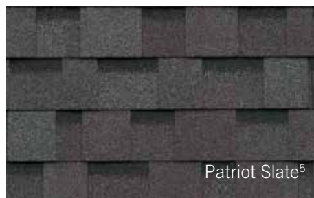
Patriot Slate 5