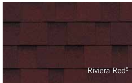
Riviera Red 5